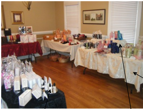
Demo products on top of small mirrors