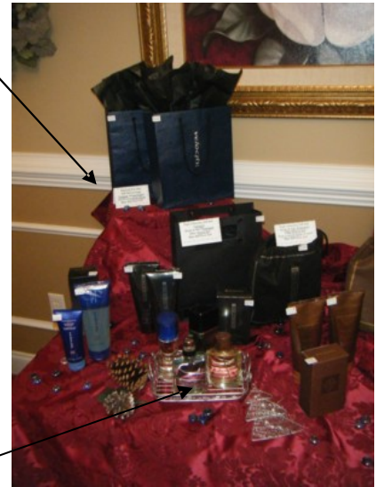
Tent cards with original and discounted prices