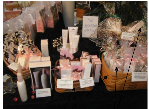
Baskets give it a "boutique" feel